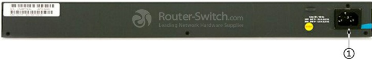
Figure 3 shows the back panel of Aruba J9775A.