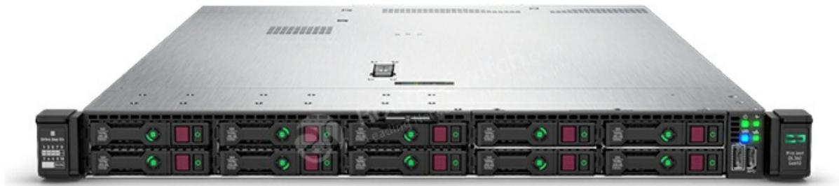
Figure 2 shows the front panel of HPE DL360 Gen10 8SFF.

Figure 1 shows the appearance of HPE DL360 Gen10 8SFF.