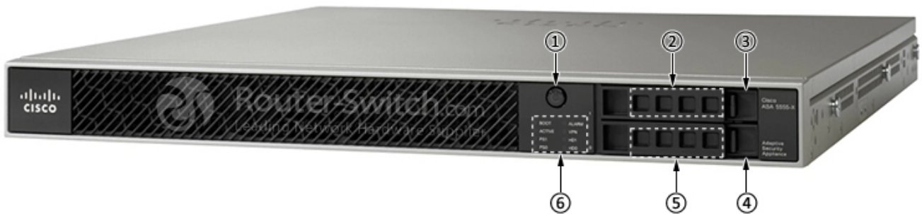
Figure 1 shows the front panel.