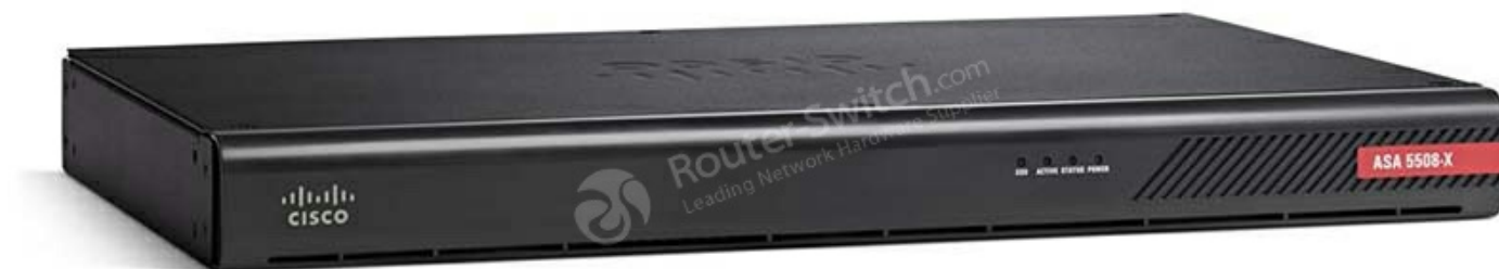
Table 1 shows the quick spec.

Figure 1 shows the appearance of ASA5508-FTD-K9.