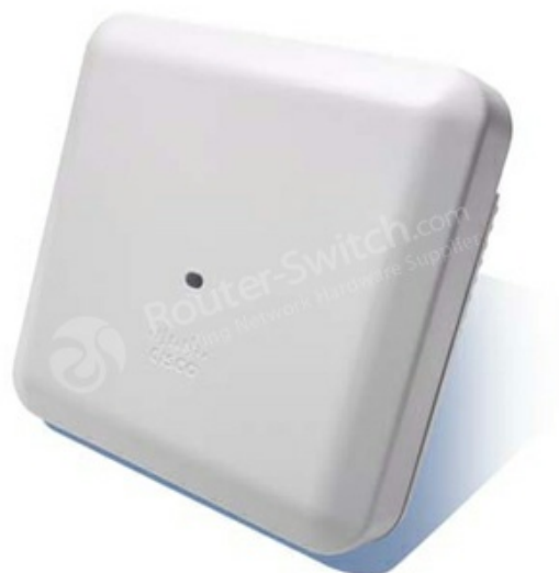
Figure 1 shows the face of AIR-AP2802I Model.