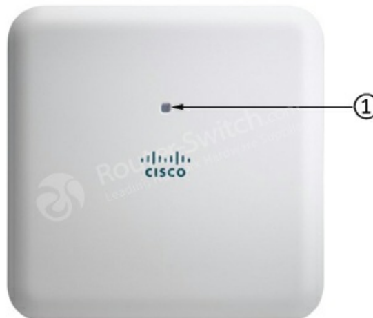
Figure 1 shows the AIR-AP1832I LED Indicator Position.