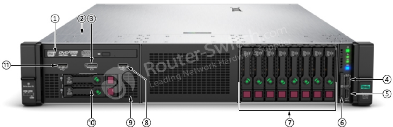
Figure 1 shows the HPE DL560 Gen10 front view.