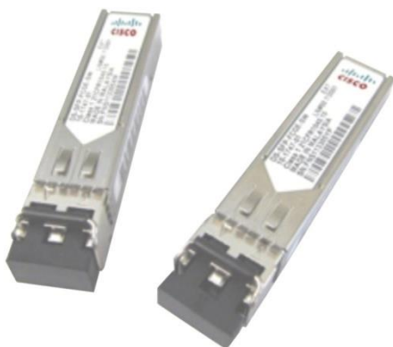
Figure 1. Cisco 2-Gbps Fibre Channel SFP Modules

Cisco 2-Gbps Fibre Channel SFP modules (Figure 1) provide cost-effective Fibre Channel connectivity for MDS 9000 Family Fibre Channel switching modules. Two types are available: the Cisco Fibre Channel Shortwave SFP (part number DS-SFP-FC-2G-SW) and the Cisco Fibre Channel Longwave SFP (part number DS-SFP-FC-2G-LW). Each offers 1/2-Gbps autosensing Fibre Channel connectivity.