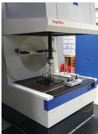
Various Inspection equipment