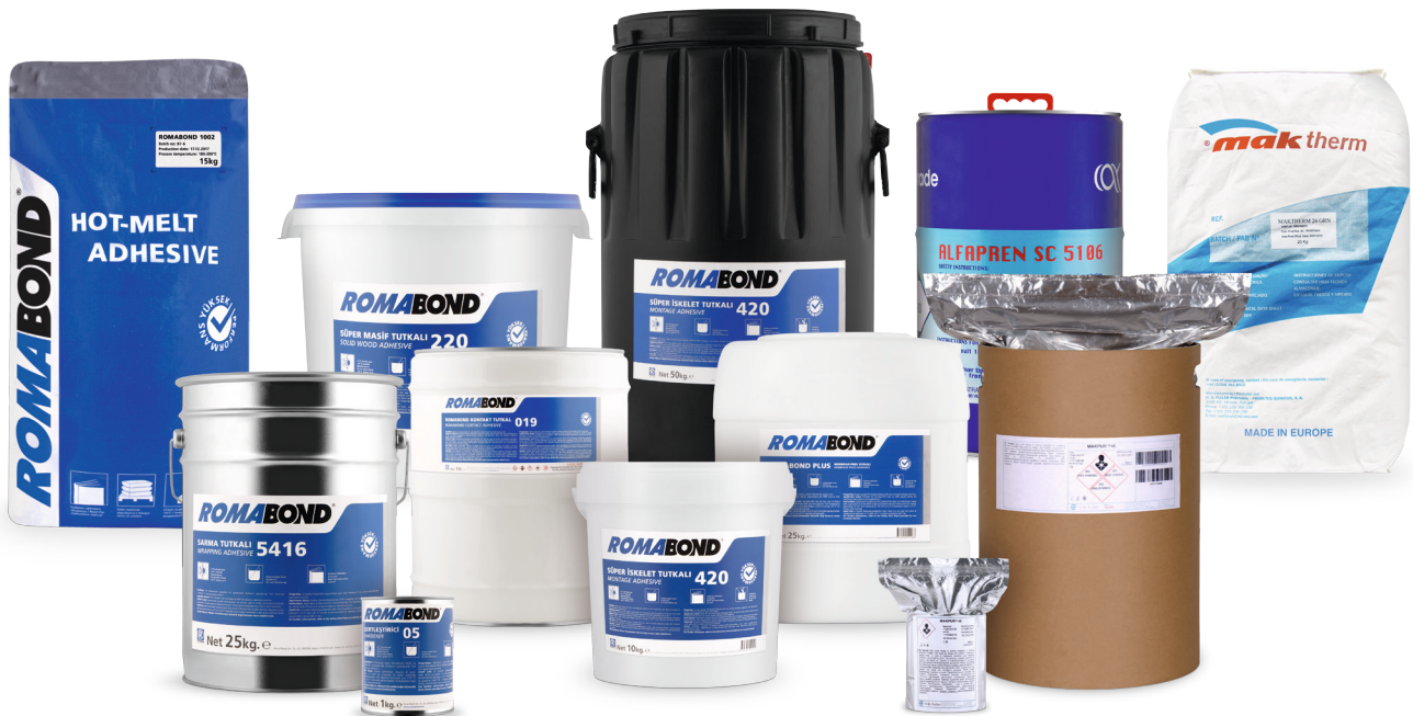
Industrial Adhesives product range