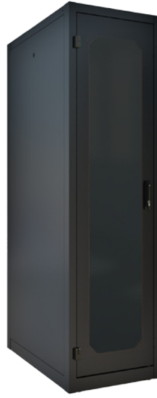
Series 24 Universal Patching Cabinet – Kitted