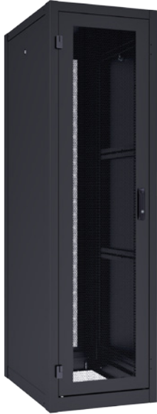
Series 24 Universal Server Cabinet – Kitted

R. F. Mote Series 24 Kitted Cabinets include: 2 lockable doors, 2 side panels, mounting rails, levelling feet, top cover plates, and hardware package. Ganging version ships without side panels.