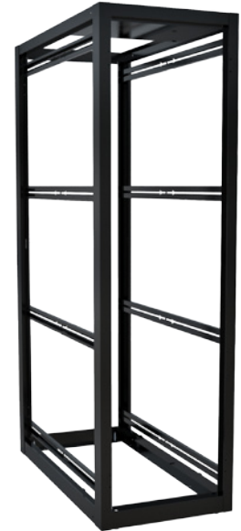
24" Wide cabinet frame