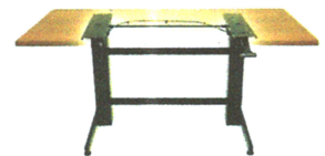
WorkFit-C Sit-Stand Desk