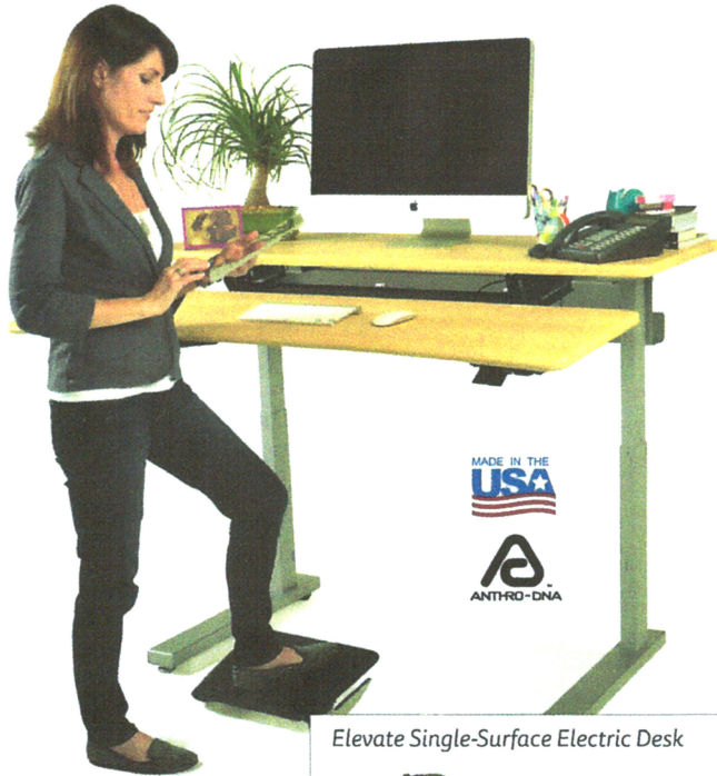
Elevate Single-Surface Electric Desk

Elevate® Adjusta Dual-Surface Electric Desk Push a button to move the front and back surfaces simultaneously. Then squeeze a lever to position the front keyboard surface exactly where you want it. A spacious front surface runs the full width of the desk. Position the front surface below or above.