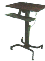
WorkFit-B Sit-Stand Base HD