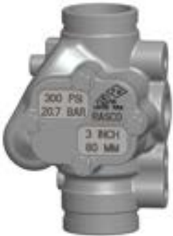
Model E3 - Grooved x Grooved