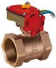
RBVT THREADED BUTTERFLY VALVE