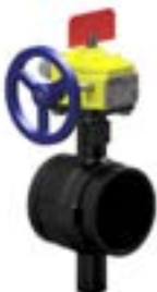
REL363GT BUTTERFLY VALVE - NORMALLY CLOSED