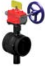
REL300GT BUTTERFLY VALVE - NORMALLY OPEN