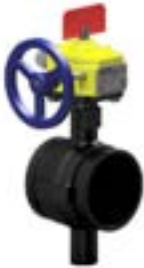
REL300GT BUTTERFLY VALVE - NORMALLY CLOSED