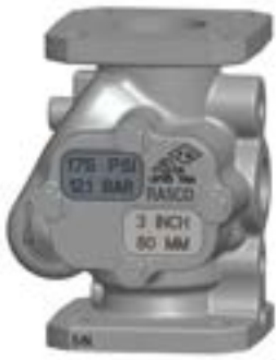
Model E - Flanged x Flanged