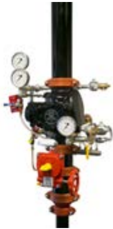
DDX-LP Dry Pipe Valve System

All fully assembled valves and Trim include the Potter pressure switches