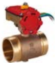
RBVG GROOVED BRONZE VALVE