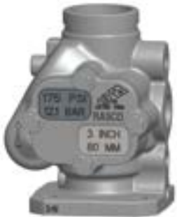
Model E - Flanged x Grooved