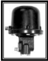
Model B-1 Accelerator