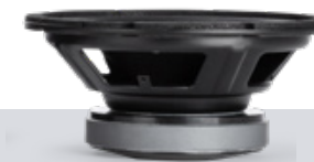
10" Woofer, 2.5" voice coil