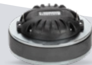
1.75" Compression Driver

Lightweight and powerful, RCF drivers are a reference in high performance. All transducers are designed by RCF engineers in Italy for maximum reliability and perfectly matched components. The new 1.75" voice coil design with Polyimide-Kapton dome features a new bonding technology and reinforcement ribs making it 10 times more rigid than previous models, for increased accuracy and durability. The redesigned phase plug increases sound clarity with less distortion. Low-frequency transducer design gains more stability over higher currents, with less distortion and better heat handling.