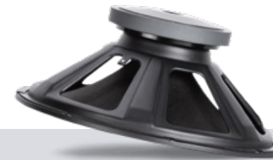
12" Woofer, 2.5" voice coil