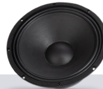
15" Woofer, 3.5" voice coil