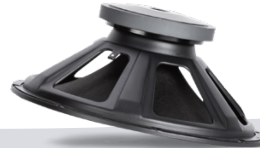
High-Power 12" Woofer 2.5" Voice Coil