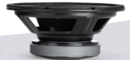
High-Power 10" Woofer 2.5" Voice Coil