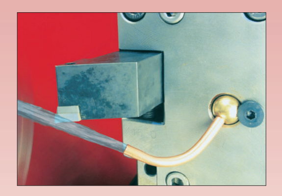
LolliPop nozzle shown installed in lathe turret.