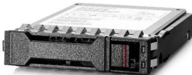
Basic Carrier (BC)