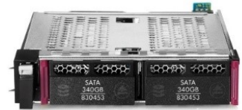
Smart Carrier M.2 (SCM)