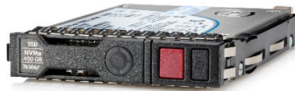
Smart Carrier NVMe (SCN)