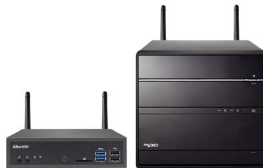
Shuttle XPC slim and XPC cube with WLN-P installed