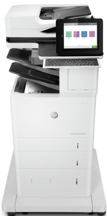
HP LaserJet Enterprise Flow MFP M635z