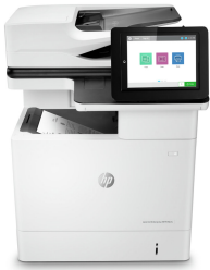
HP LaserJet Enterprise MFP M635h

This HP LaserJet MFP with JetIntelligence combines exceptional performance and energy efficiency with professional-quality documents right when you need them—all while protecting your network from attacks with the industry's deepest security. 1