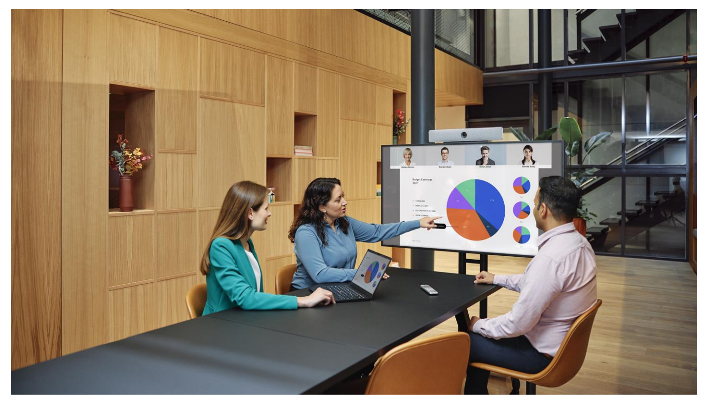
Figure 1. Cisco Webex Room USB in an open space

The Webex Room USB is ideal for huddle spaces with two to five people because of its wide 120-degree field of view, which allows everyone in a huddle space to be seen (see Figure 1). It offers the flexibility to connect to laptop-based video conferencing software via USB.