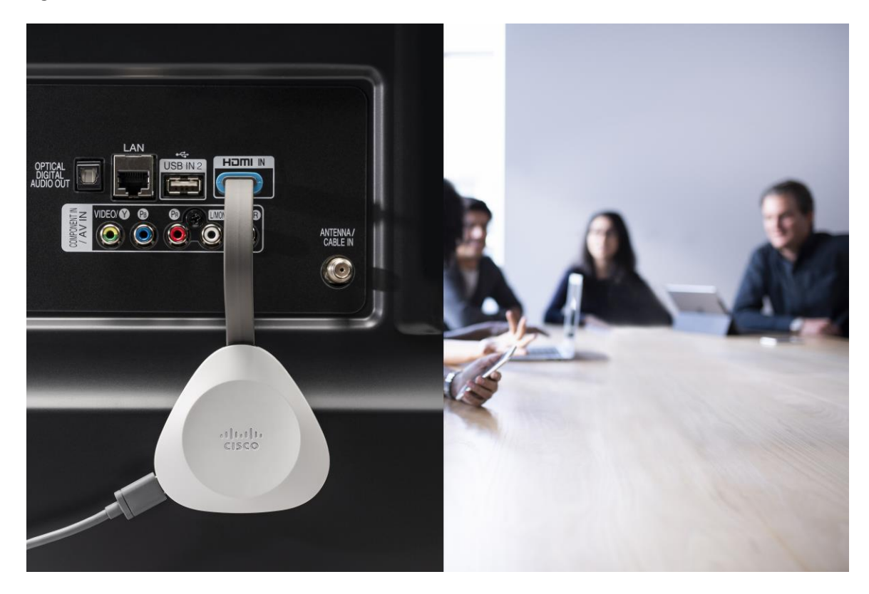
Figure 3. Webex Share installation

Cisco Webex Share is installed behind the screen (Figure 4). The package includes a cable management sticker that allows users to correctly position the device behind the display and to avoid mechanical stress on the HDMI port. The HDMI cable has been designed to sustain the device weight.