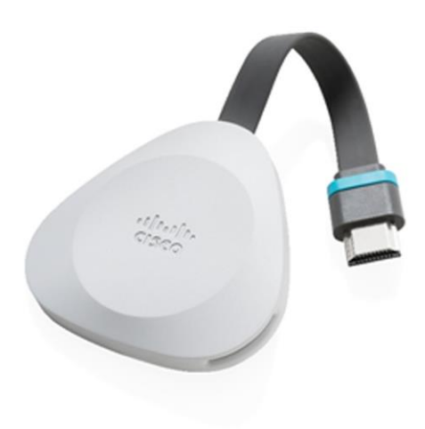
Figure 1. Cisco Webex Share

Cisco Webex Share complements the premium portfolio of Cisco Webex collaboration devices, enabling conference rooms and huddle spaces to offer the same Webex user experience as Cisco's video devices.