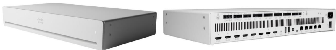
Figure 1. Cisco Webex Codec Pro

With its powerful media engine, the Room Kit Pro lets you build the video collaboration room of your dreams.