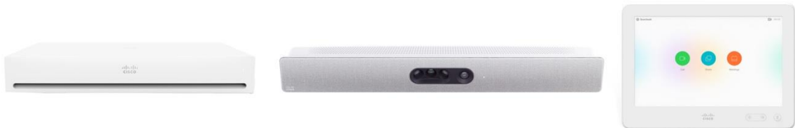
Figure 2. Cisco Webex Room Kit Pro integrator package with Quad Camera and Touch 10