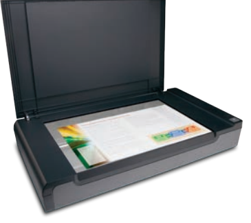
New A3 Size Flatbed Accessory

For customers who already have a Kodak A3 or A4 Flatbed Accessory, adapter kits are available that allow you to use your flatbed with a Kodak i2420, i2620 or i2820 Scanner.