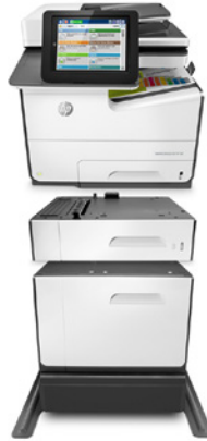
MFP; 1x500 feeder tray 3 (G1W43); cabinet/stand (G1W44)