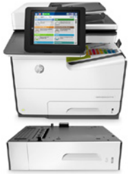
MFP; 1x500 sheet feeder (G1W43)