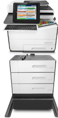
MFP; 3x500 feeder/stand (G1W45A)