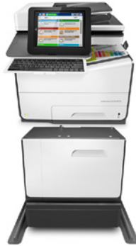
MFP; single cabinet/stand (G1W44A)