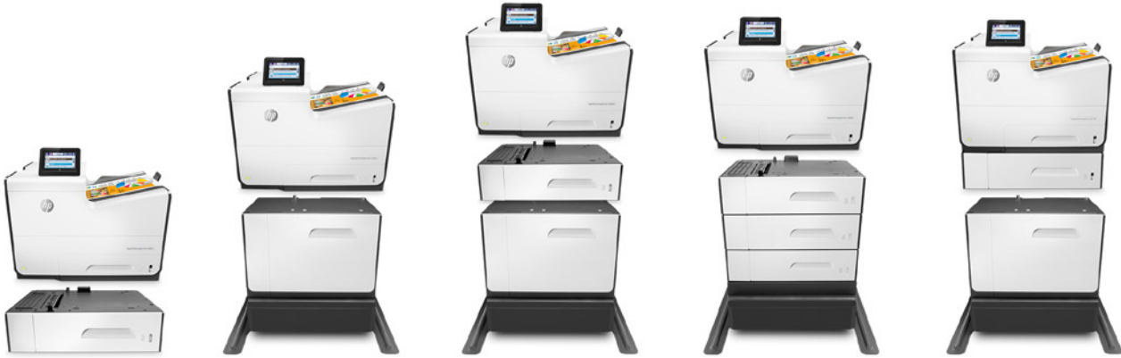
556dn printer; 1x500 sheet feeder (G1W43)