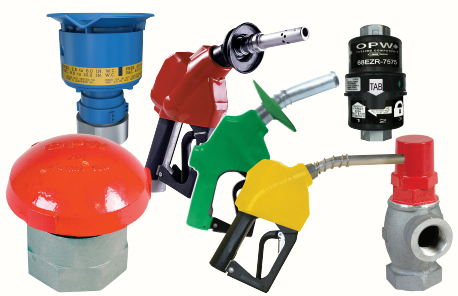
Above Ground Products

Setting the industry standard in retail and commercial fueling solutions worldwide since 1892.