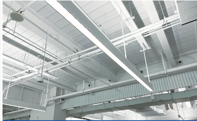
LED Linear-E II Office