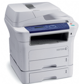
WorkCentre 3210/3220 shown with second 250-sheet paper tray (optional).

Set-up has been simplified and streamlined; the multifunction printer is easily installed and can be quickly integrated into an existing network. Most configuration, monitoring and troubleshooting can be managed from the user's computer, and the highly intuitive front panel offers large, easy-to-read buttons for common functions. Its usability-conscious design gives the multifunction printer only a single customer-replaceable cartridge, keeping maintenance to a minimum.