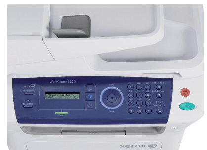
Whether printing, copying, scanning or faxing, the easy-to-navigate user interface intuitively guides users from start to finish.