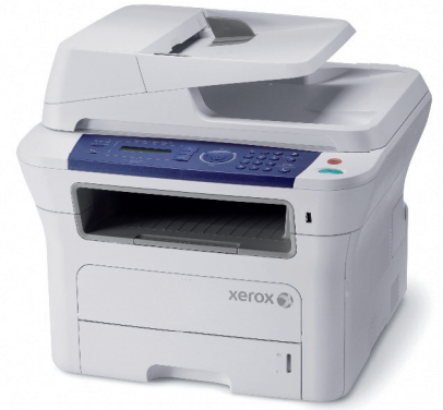
The WorkCentre 3210/3220 is an office-space saver – combining print, copy, scan and fax functions in one convenient, compact device.