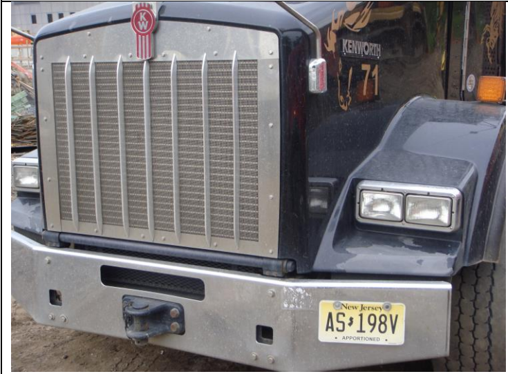
Truck/License Nos. 71/AS-198V NJ