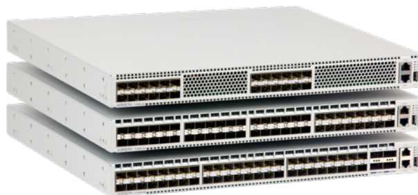
Arista 7150S family

Designed to suit the requirements of demanding environments such as ultra low latency financial ECNs, HPC clusters and cloud data centers, the class-leading deterministic latency from 350ns is coupled with a set of advanced tools for monitoring and controlling mission critical environments.