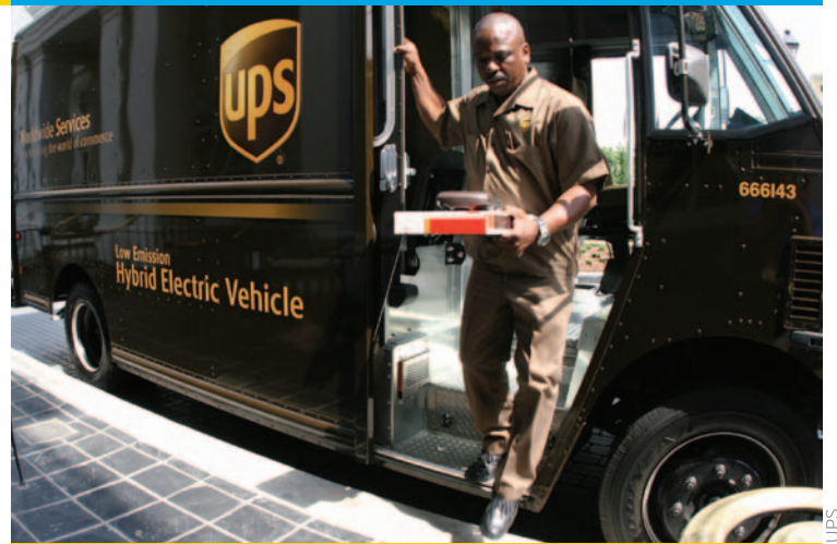
UPS' hybrid electric delivery vans demonstrate 31% to 37% higher fuel economy than comparable conventional vans.

This project is part of a series of evaluations performed by NREL's Fleet Test and Evaluation team for the U.S. Department of Energy's (DOE) Advanced Vehicle Testing Activity (AVTA). AVTA bridges the gap between research and development and the commercial availability of advanced vehicle technologies that reduce petroleum use and improve air quality in the United States. The main objective of AVTA projects is to provide comprehensive, unbiased evaluations of advanced vehicle technologies in commercial use. Data are collected and analyzed for operation, maintenance, performance, costs, and emissions characteristics of advanced-technology fleets and comparable conventional-technology fleets operating at the same site. AVTA evaluations enable fleet owners and operators to make informed vehicle-purchasing decisions.