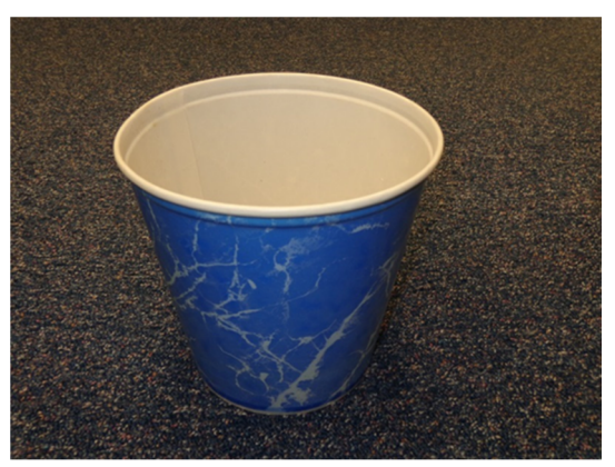
Empty popcorn bucket