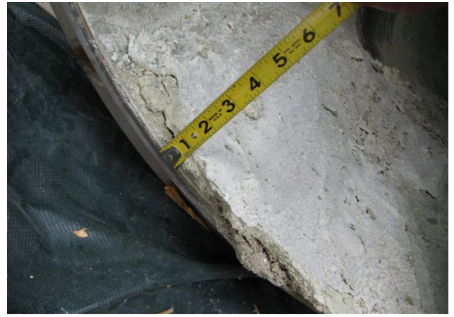
May 27, 2016 Inlet Transition Elbow