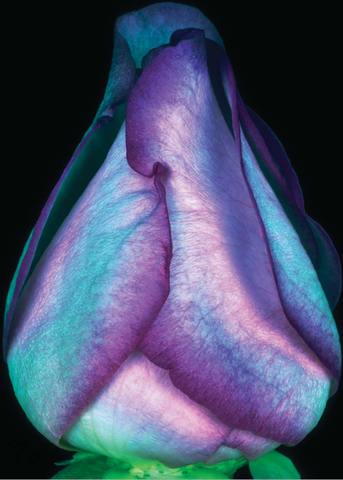
Tea Rose