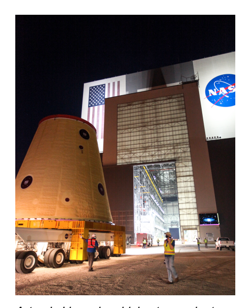
Artemis I launch vehicle stage adapter