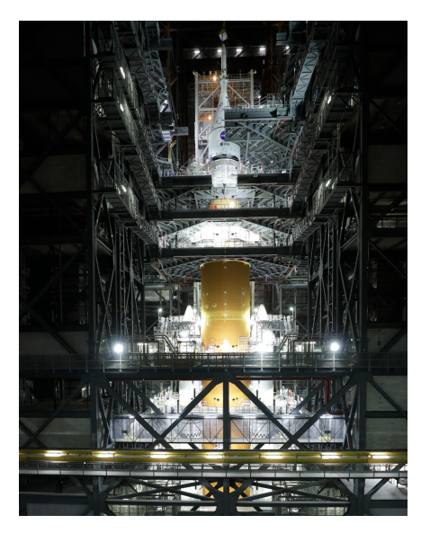
Artemis I stacked in the Vehicle Assembly Building at Kennedy

SLS is America's rocket, with more than 1,100 companies from across the U.S. and every NASA center supporting its development. The SLS Program, managed at Marshall, works closely with the Orion Program, managed at NASA's Johnson Space Center in Houston, and the Exploration Ground Systems Program, managed at Kennedy.