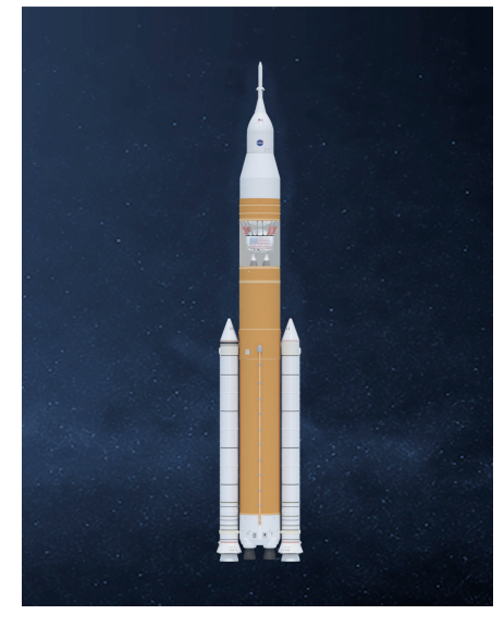
SLS Block 1B crew with exploration upper stage cutaway (illustration)

National Aeronautics and Space Administration