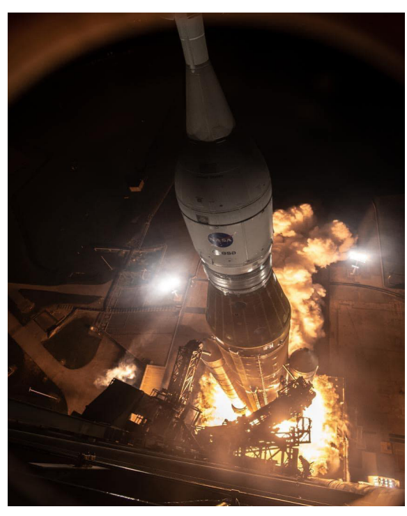
NASA's SLS (Space Launch System) rocket carrying the Orion spacecraft launches on the Artemis I flight test, Wednesday, Nov. 16, 2022, from Launch Complex 39B at NASA's Kennedy Space Center in Florida.

SLS is designed for deep space missions and will send Orion or other cargo to the Moon, which is nearly 1,000 times farther than where NASA's International Space Station resides in Low Earth orbit. The high-performance rocket