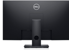
Back view - Cable management slot

Easily adjust the panel to your preferred viewing position.