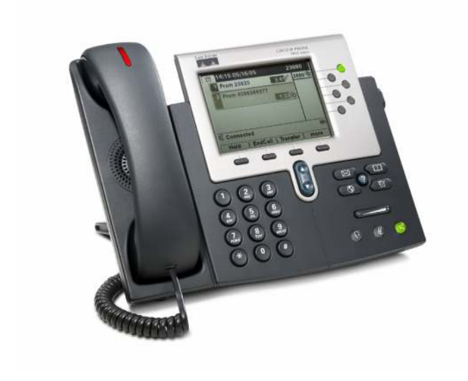
Figure 1. Cisco Unified IP Phone 7961G

The Cisco Unified IP Phone 7961G, an important addition to the Cisco Systems® award-winning IP phone portfolio, is a full-featured, enhanced manager IP phone. It is designed to meet the needs of managers and administrative assistants (Figure 1). It provides six programmable backlit line/feature buttons and four interactive soft keys that guide a user through call features and functions, and audio controls for high-quality duplex speakerphone, handset, and headset. A built-in headset port and an integrated Ethernet switch are standard with the Cisco Unified IP Phone 7961G. The phone also features a best-of-class large, higher-resolution grayscale pixel-based LCD (Figure 2). The display provides features such as date and time, calling party name, calling party number, and digits dialed. The crisp graphic capability of the display allows for the inclusion of higher value, more visibly rich Extensible Markup Language (XML) applications and double-byte languages.