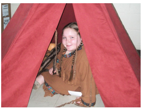
4th Grade Wax Museum. Great Job, 4th Graders!

Thank you to everyone who came out to support Literacy Night. It was a great night.