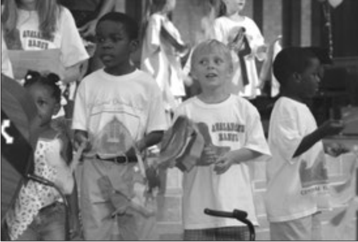
Children from around the conference sing Jesus Loves Me during the Mission Service held June 11.

A member of Rust College's A'Cappella Choir greets a member of the Mississippi Annual Conference during Tuesday's afternoon business session. The choir performed as part of the college's report to the conference.