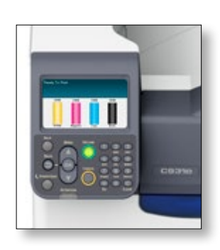
Color LCD display shows current status of the printer; built-in toner gauge indicates the remaining life of each toner cartridge.

Users can get an instant read on the C931e's status via the color LCD display, with its easy-to-read messaging and graphics. The alphanumeric keypad makes entering commands a snap. And the front-accessible compartment makes replacing consumables quick and easy: it takes seconds to switch out used toner cartridges or image drums for high-capacity Genuine OKI® replacements.