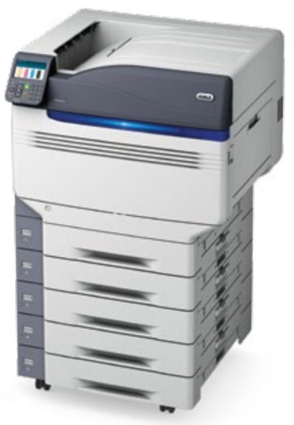
Optional 2nd tray and high-capacity feeder (with casters) increase paper capacity to 2,950 sheets max.