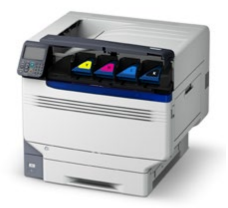
Front-accessible consumables make changing or replacing toner cartridges and image drums easy and quick.