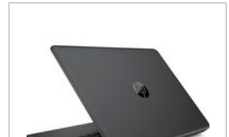
Left rear facing

54 x 41 (jpg) 54 x 41 (png) 100 x 70 (jpg) 96 x 72 (jpg) 96 x 72 (png) 99 x 74 (png) 153 x 115 180 x 135 (png) (png) 240 x 180 240 x 180 (jpg) (png) 247 x 185 170 x 190 (png) (jpg) 257 x 193 320 x 240 (png) (jpg) 320 x 240 474 x 356 (png) (png) 513 x 385 400 x 400 (png) (jpg) 400 x 400 573 x 430 (png) (png) 800 x 600 1659 x 1246 (png) (png) 1500 x 1388 3028 x 1830 (jpg) (png) 3030 x 1920 (jpg)