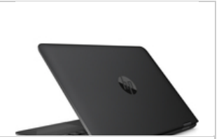
Left rear facing