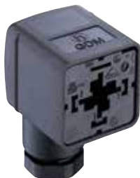
Housing Color: Black