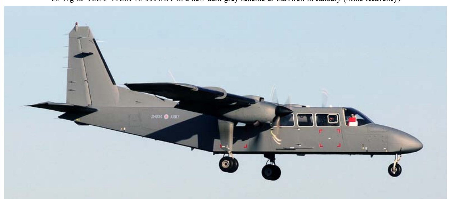
651 Sqn Defender T.3 ZH004 at Prestwick on January 13th in a standard grey c/s now (John Wilson)