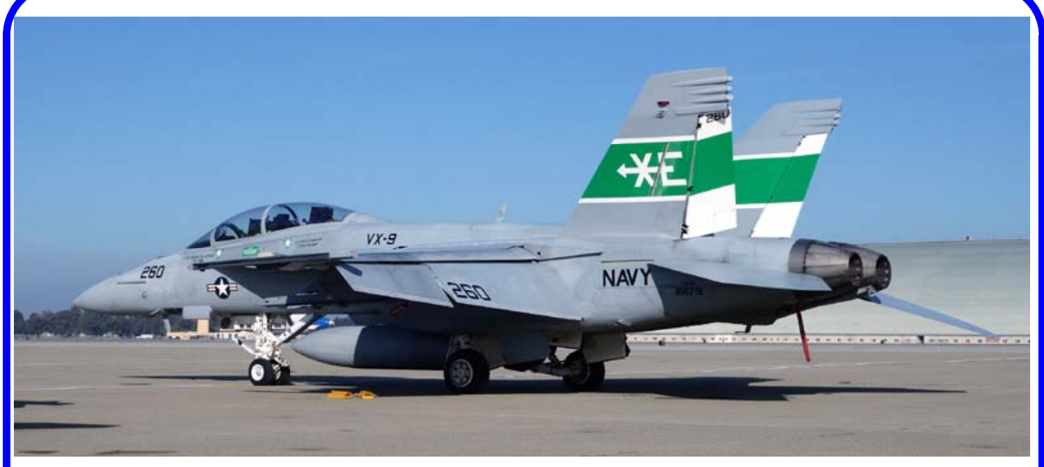
Visiting Moffett Field on 14th January was this VX-9 F/A-18F 166791/XE-260 - present for a flypast