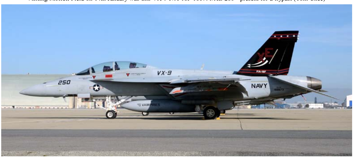
Also present at Moffett Field for the flypast was another VX-9 F/A-18F 166673/XE-250 in a different scheme (Tom Chee)