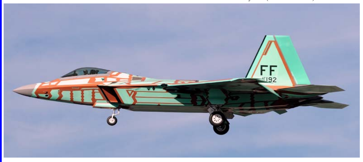
F-22A 10-4192/FF at Marietta on December 27th on a test flight prior to delivery to the 1st FW