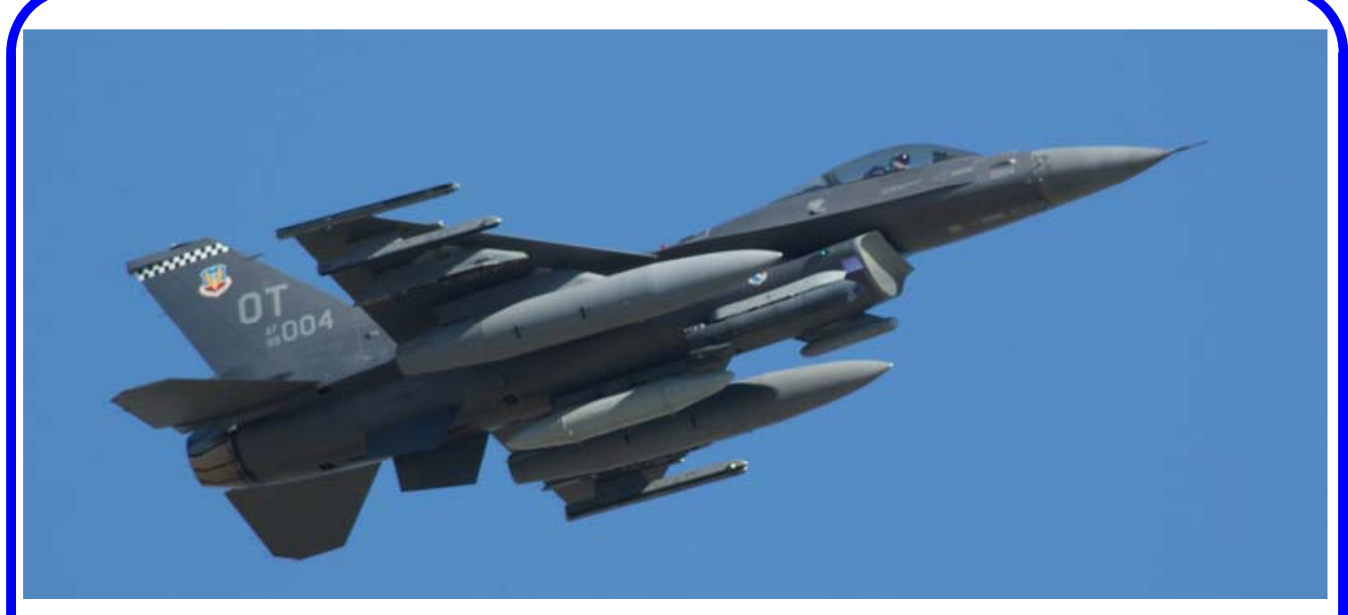
53 Wg 85 TES F-16CM 98-0004/OT in a new dark grey scheme at Carswell in January (Mike Keaveney)