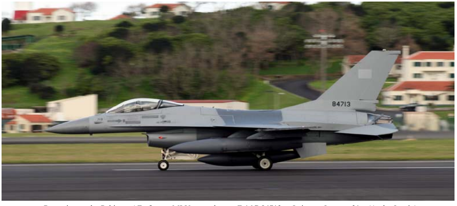
Returning to the Pakistan AF after an MLU upgrade was F-16C 84713 at Lajes on January 31st