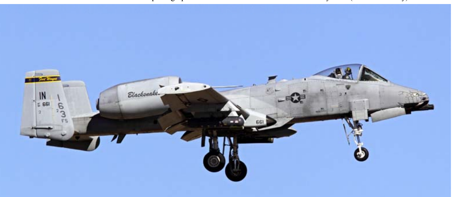
New Indiana ANG 163 FS A-10C 82-0661/IN at Davis Monthan on January 31st