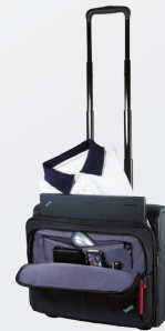
ThinkPad Radiant Roller - PN 78Y2375