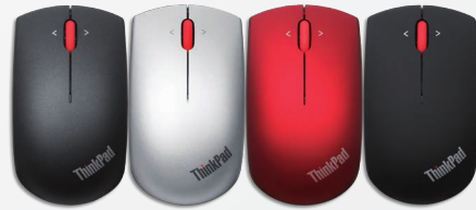
ThinkPad Precision Wireless Mouse - Midnight Black 0B47163, Heatwave Red 0B47165, Frost Silver 0B47167, Graphite Black 0B47168, Midnight Black 0B47153