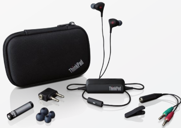
ThinkPad® Noise Cancelling Earbuds (0B47313)