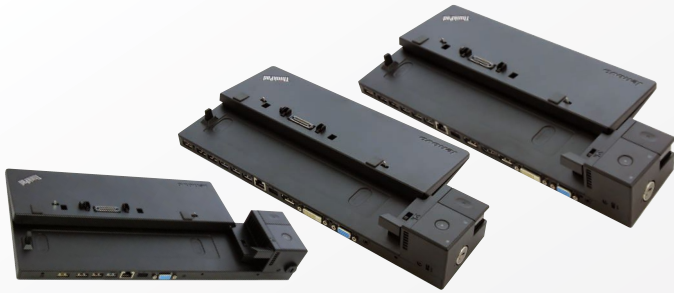
ThinkPad® Ultra Dock(40A20090XX), ThinkPad® Pro Dock (40A10065XX), ThinkPad® Dock (40A00065xx)