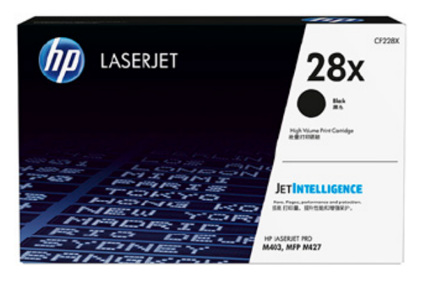
Original HP Toner cartridge with JetIntelligence

Bring out the best in your MFP. Print more consistent, high-quality pages than ever before, <sup>2</sup> using specially designed Original HP Toner cartridges with JetIntelligence. Count on better performance, higher energy efficiency, and the authentic HP quality you paid for-something the competition simply can't match.<sup>2</sup>