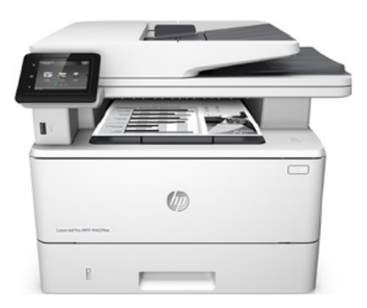
Make the most of your workspace-this smallest MFP in its class<sup>3</sup> is the perfect fit

Shift your office into high gear with this powerful MFP that doesn't keep you waiting. Print your first page and produce two-sided prints faster than the competition<sup>3</sup> and scan quickly. Keep your device, data, and documents safe-from the moment you boot up to the moment you shut down.