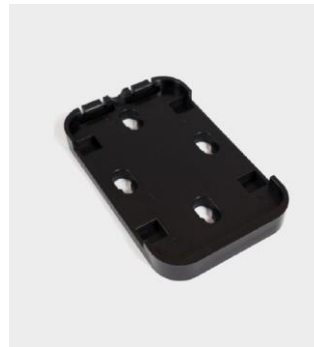
Snap-In Holder black