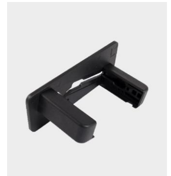
Bracket Holder black