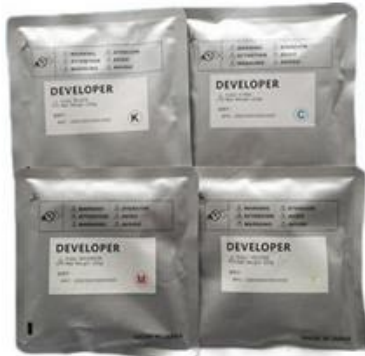
Model: MPC3503 Developer MPC2003/2503/3003/3503 /4503/5503/6003

604-9, No. 22, Guanri Road, Software Park II, Xiamen Torch Development Zone For High Technology Industries Tel: +86 592 6896238 Mob: +86 13860165915 http://www.kreyoly.com Email: info@kreyoly.com