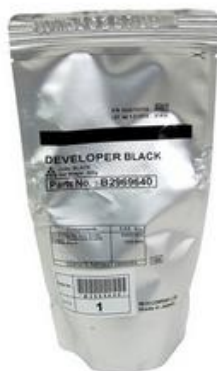
Model: MP4000 Developer MP3500/4000/4500/5000