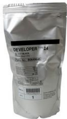
Model: Type 24 AF1075/1065/1035/1060/2 051/2060/2075/MP7500