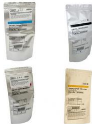
Model: MPC2500 Developer MPC2500/3000/3500/4500/SPC 810/811