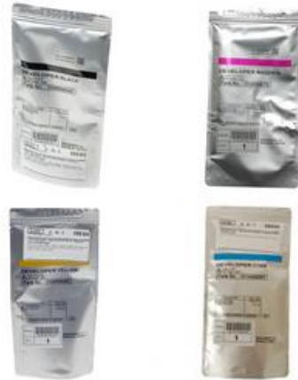
Model: MPC3501 Developer MPC3001/3501/4501/3002/3502 /4502/5502