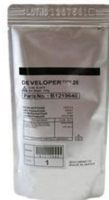
Model: Type 28 AF2015/2018/2016/2020/1800/1 610