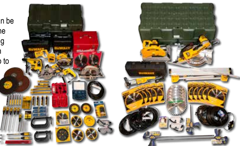
TABLE SAW & ROUTER TOOL KIT

The Kipper Table Saw & Router Tool Set provides specific tools, common to the complete carpenter shop set, to supplement additional carpentry teams in modular fashion. Carpenter teams can be deployed with this Tool Set without impacting the capabilities of the parent unit and accomplish finish carpentry tasks with greater levels of accuracy and higher production rates. This Tool Set is used to support a fabrication shop - making repetitive, accurate cuts and intricate cuts; and also trims, moldings, and other piecemeal work of both a functional and ornamental nature.