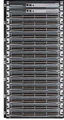
HPE FlexFabric 12916E Switch Chassis (JH103A)