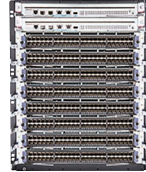
HPE FlexFabric 12908E Switch Chassis (JH255A)