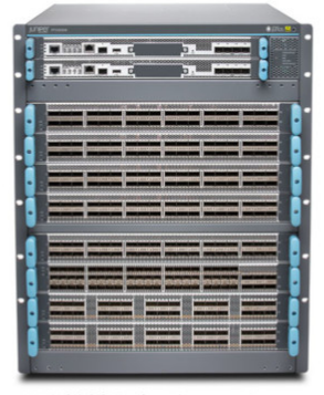
PTX10008 Packet Transport Router