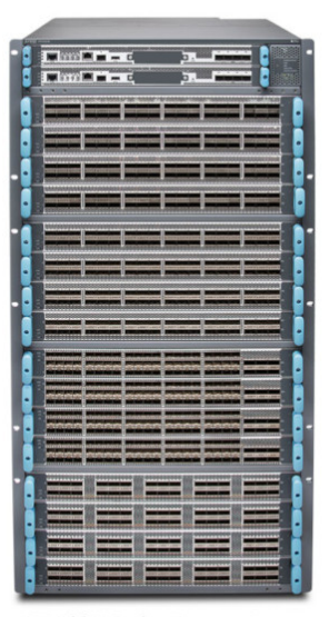
PTX10016 Packet Transport Router