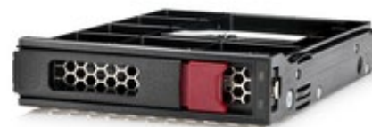
Low Profile Converter (LPC)