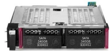
Smart Carrier M.2 (SCM)