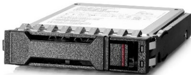
Basic Carrier (BC)