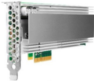
PCIe Add-in-Card (AIC)