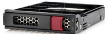
Low Profile Converter (LPC)