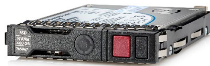
Smart Carrier NVMe (SCN)