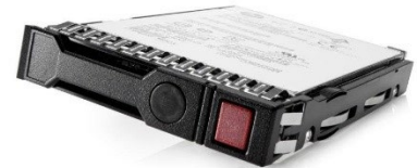
Smart Carrier (SC)