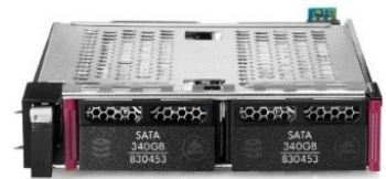
Smart Carrier M.2 (SCM)